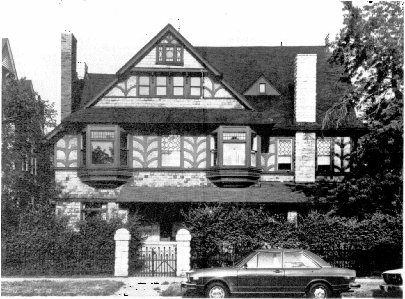
This house at 4800 Kimbark Avenue was built around 1888 and is an excellent example of the Queen Anne style. The facade is arranged more formally than those of most Queen Anne houses. A variety of materials of different colors and textures enlivens the facade, and projections, chimneys, and intersecting roofs create a picturesque composition.

Early in this period, Hyde Park Township experienced governmental problems. The population had grown considerably, and economic differences among the communities began to create difficulties. In addition, the government was rather haphazardly administered, a situation that was dramatically demonstrated in 1878 when the township treasurer, who was a Kenwood resident, admitted that the treasury was short $114,032.62 and he could not account for the money.